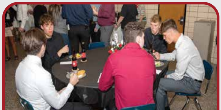
A group of friends from the SHS Class of 2024 sat down and enjoyed the refreshments at the SHSAA Open House while others socialized together.