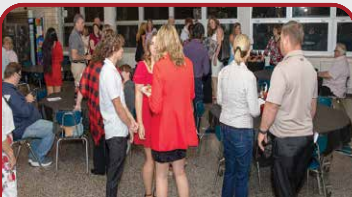
Scholarship recipients, parents, family, friends, and alumni attended the SHSAA Open House in the cafeteria after the 143rd Annual Meeting and Scholarship Award Ceremony.