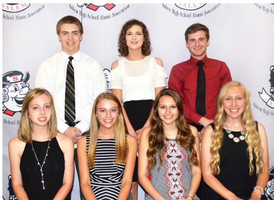
2018 Academic Merit Scholarship Recipients